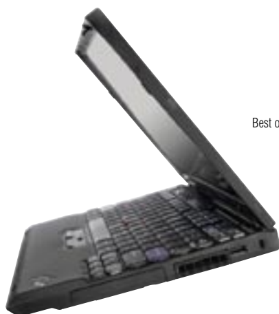
IBM ThinkPad X30 Best of 2002: Windows Portable PC Fortune Magazine December 2002